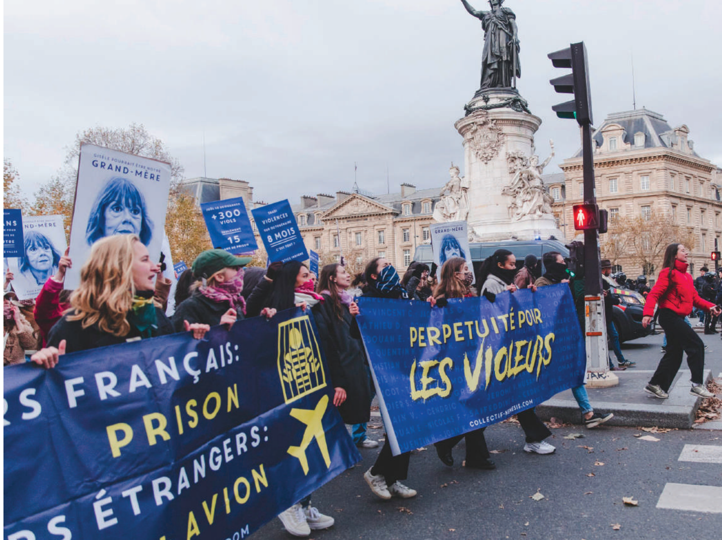
▲ Activists from the Collectif Nemesis during a demonstration in Paris.